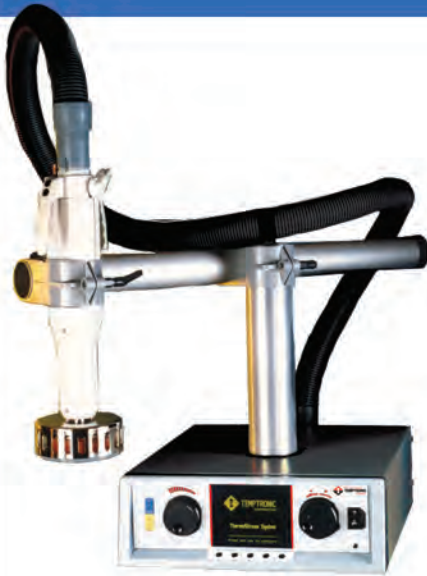
ATS-605 SHOWN WITH OPTIONAL THERMAL STAND

Designed for 60Hz operation only , this Advanced Temperature Source is for fast and precise thermal conditioning of components, parts, hybrids, modules, subassemblies, and printed circuit boards. Capable of ultra-low temperatures without the use of Liquid Nitrogen (LN 2 ) or Liquid Carbon Dioxide (LCO 2 ).